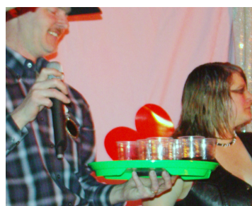
Duke and Duchess sell Troll Water