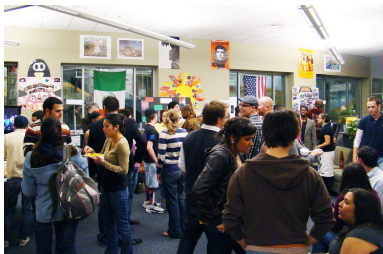
The crowd at the QSU Mixer in the Diversity Center on the UofN campus

For more information contact the QSU at queerstudentunion.com or on facebook.