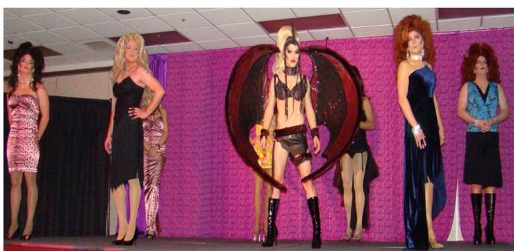
.....and in an hour changed to women